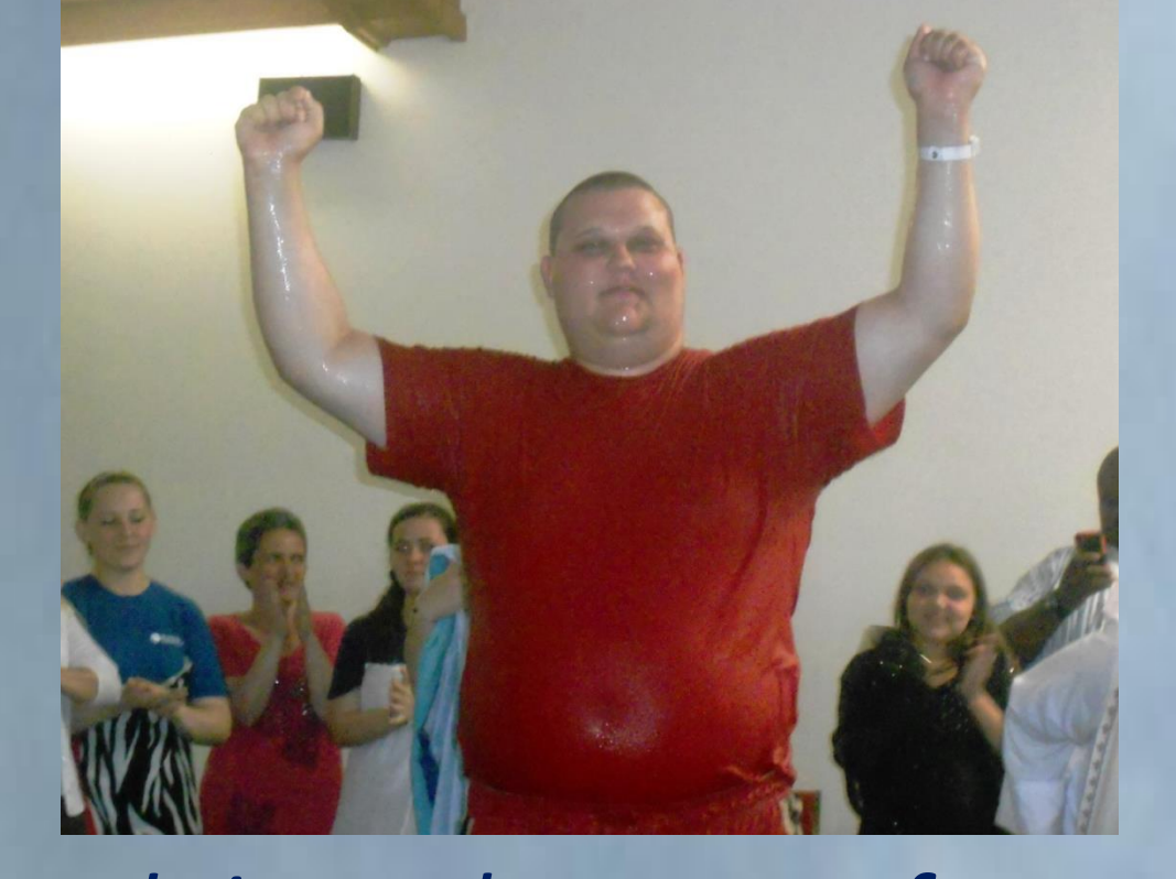
JOY in good times, because of circumstances JOY in hard times, despite circumstances JOY at all times because of HOPE in the coming Christ