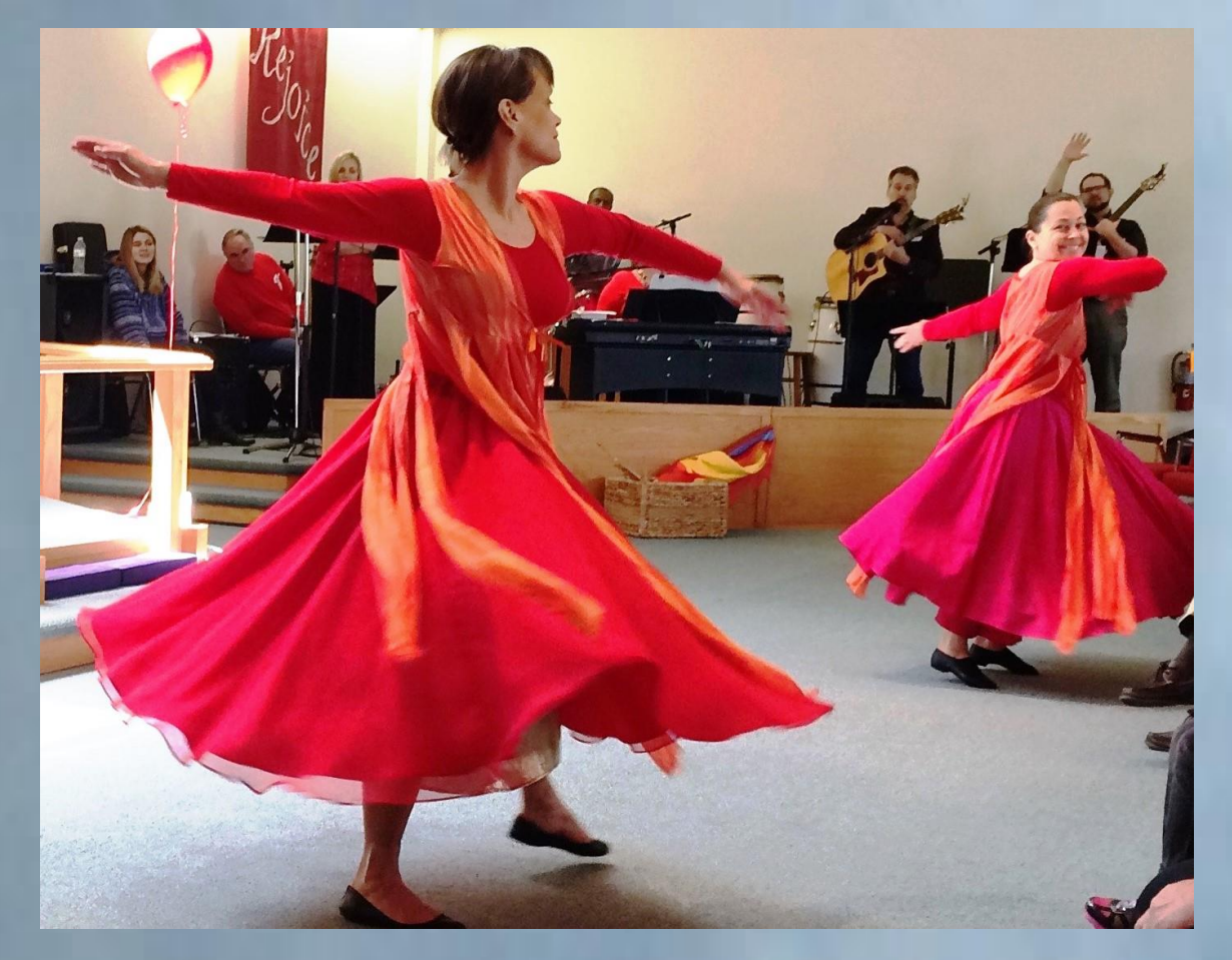
Why Is Our Joy So Important To The Lord?